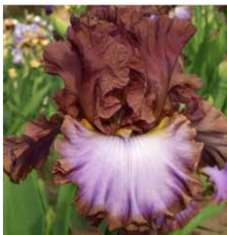
House Arrest (Keppel)