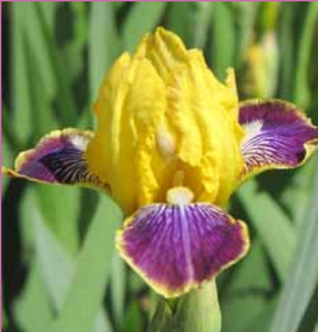
Plum Happiness - IB (Miller)