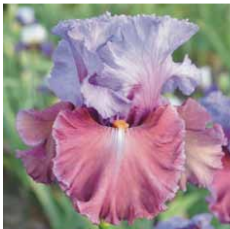
Chasing Destiny (Blyth)