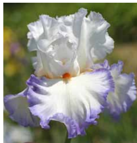
Betty Ford (Kerr)