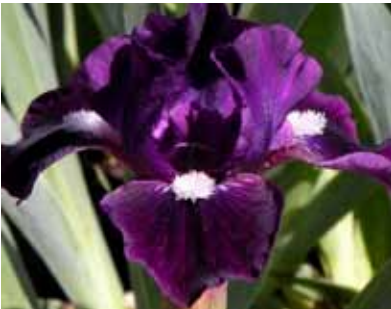
SDB Wish Upon A Star (Black)

Sources: AIS Wiki and Median Iris Society