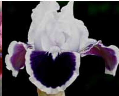
SDB Puddy Tat (Black)