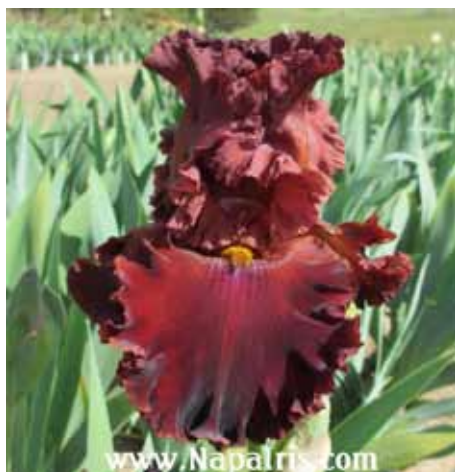
Hearts on Fire (Painter, J)