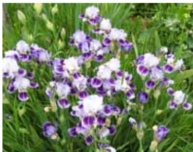
MTB Dividing Line (Bunnell)