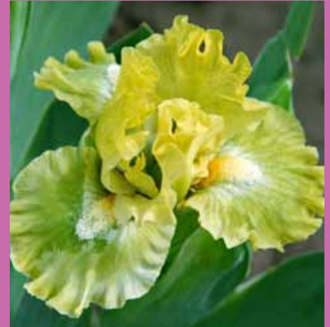
Greenland - SDB