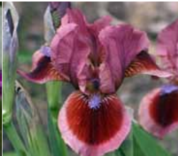
SDB Cat's Eye (Black)