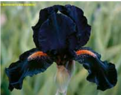
IB Devil May Care (Black)