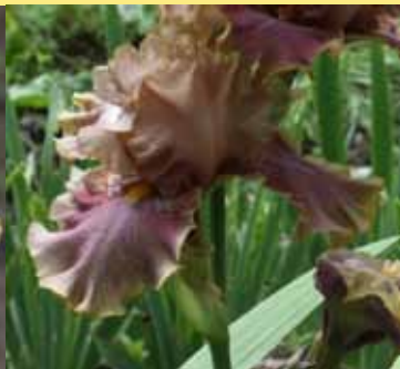
LIEUTENANT STAR WALKER (Walker'14) TB $50.00