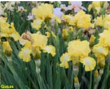
IB Lemon Pop (Lauer)