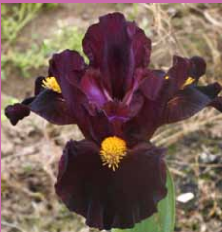
Dragonet - BB