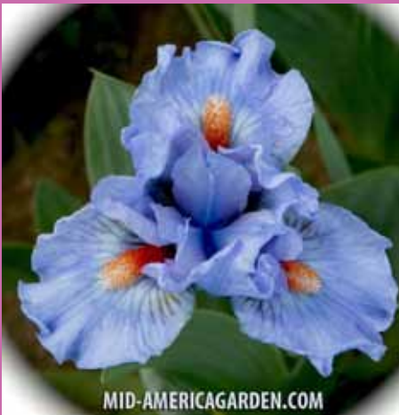
Crank It Up - SDB (Black)