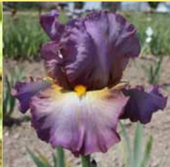
EVENING SUNSET (Ernst'14) TB $50.00