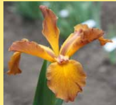
EUREKA TITAN (Walker'14) Spuria $50.00