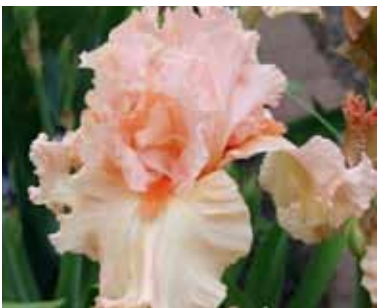
BB Eye Candy (Keppel)