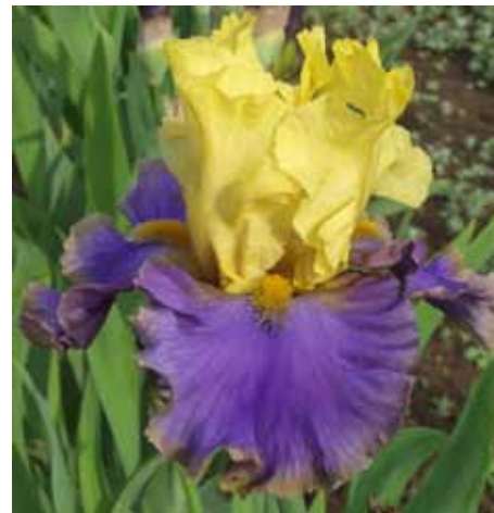
Gambling Man (Keppel)