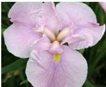
Essence of Summer - JI (Aitken)