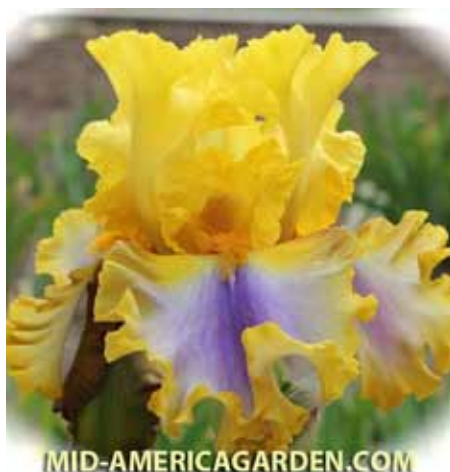
Good Morning Sunshine