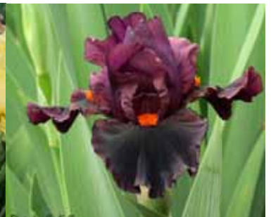
IB Garnet Slippers (Keppel)