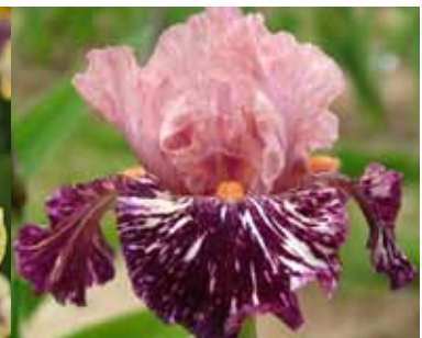
BB Anaconda Love (Kasperek)