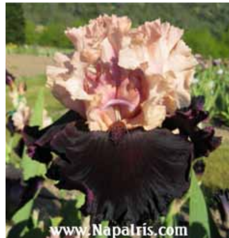
Midnight Rose (Painter, L)