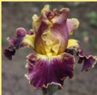
DON QUIXOTE DREAMS (Walker'14) TB $50.00