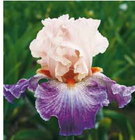
Damsel In A Dress (Schreiner)