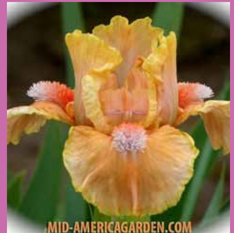
Orange Obsession - SDB (Black)