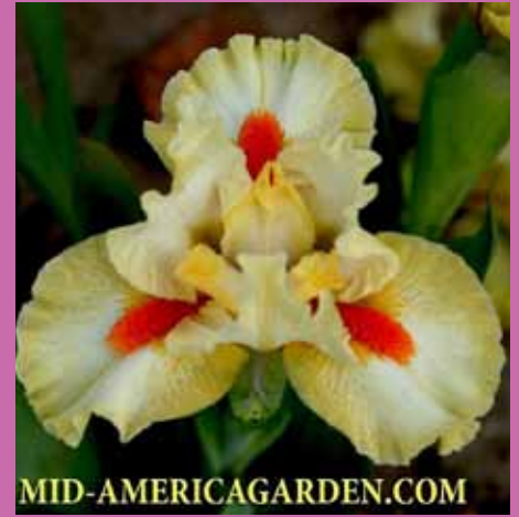
Comic - SDB (Black)