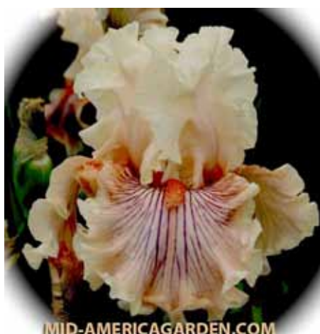
Escape from Boredom (Black)