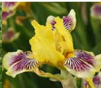
MTB Plum Quirky (Probst)