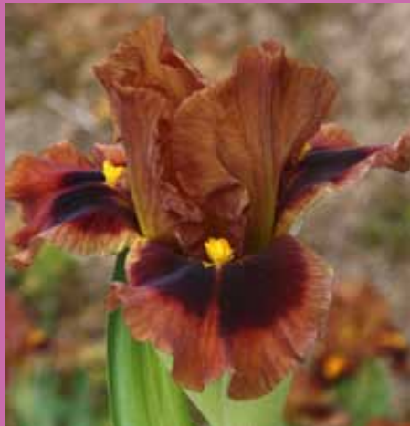
Chocolate Treat - SDB (Aitken)