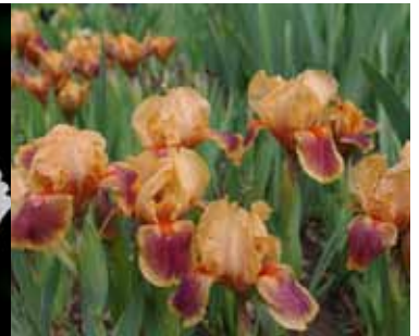
SDB Pele (Aitken)