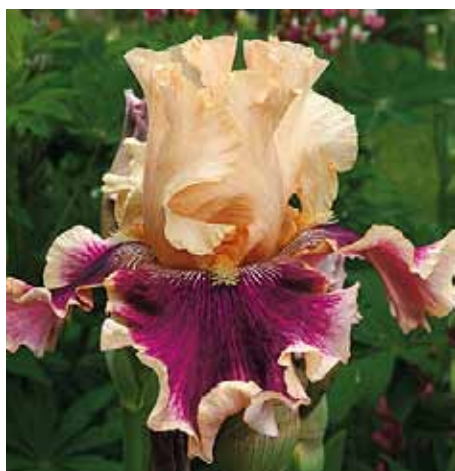
Skirting The Issue (Schreiner)