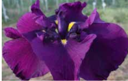
Midnight Fireworks - JI (Aitken)

READ THIS ISSUE ONLINE AT www.region15ais.org