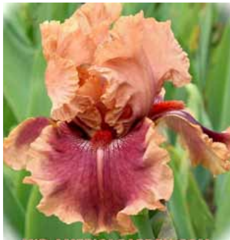
Ancient Treasures (Black)