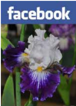
Southern California Iris Society

Southern California Iris Society (SCIS) Held a Louisiana and Spuria iris auction in September followed by a Pacific Coast Native Iris auction in October. Our annual Christmas party and mini-business meeting was well attended. Much merriment was provided by the gift exchange when gifts were stolen from one member by another member.