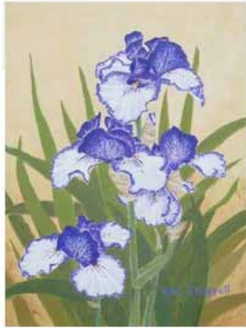
Lompoc Valley Iris Society