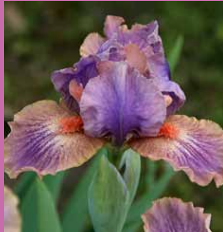
April Fanfare - SDB (Black)