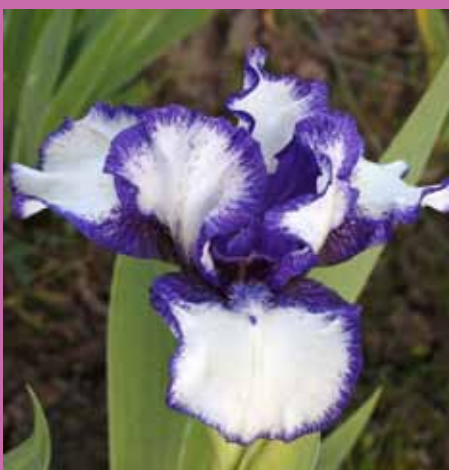
Fairy Fireworks - SDB (Aitken)