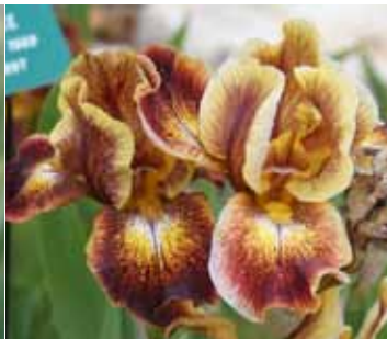
IB Hot Spice (Aitken)