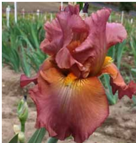
Classical Brass (Richards)